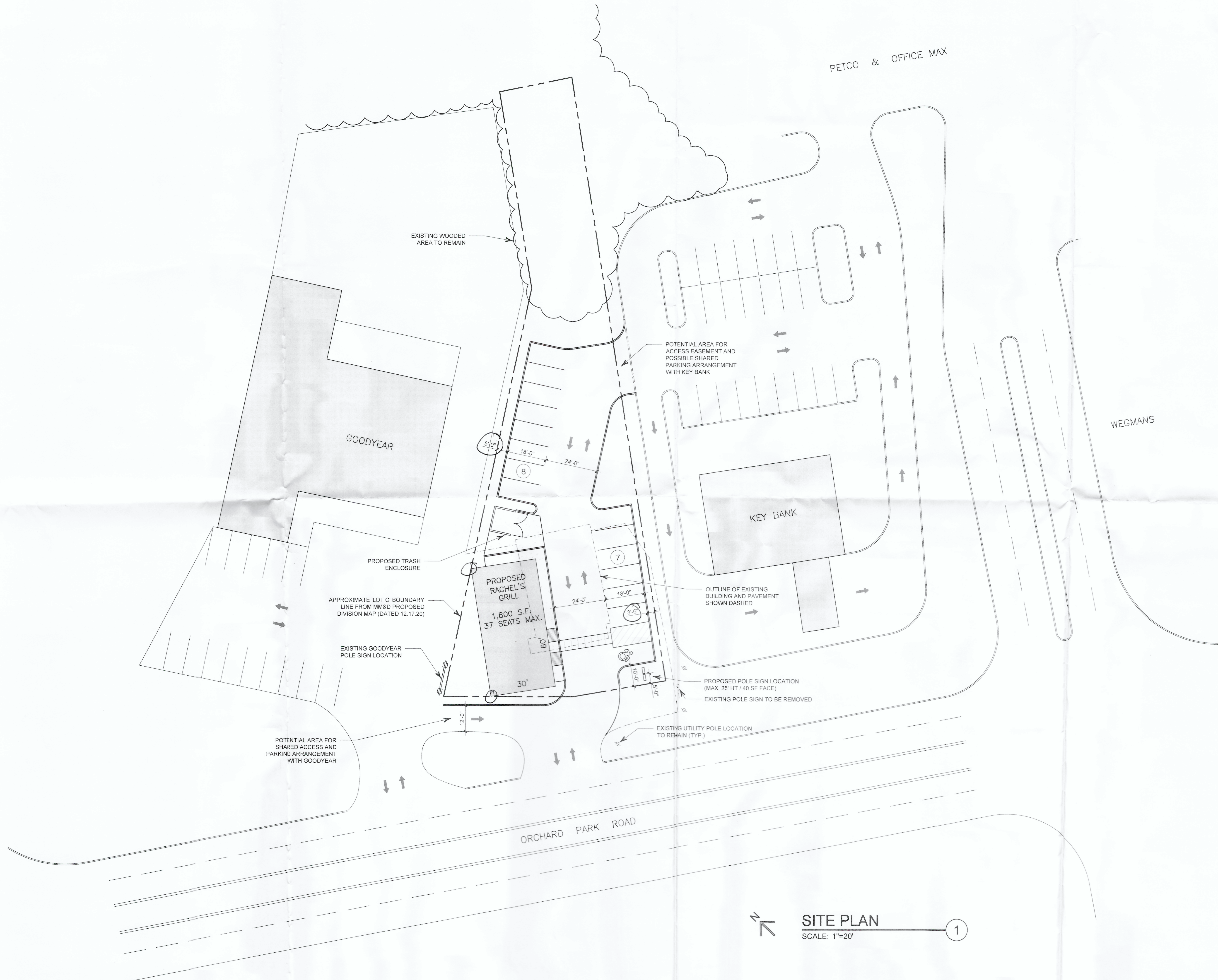
SITE PLAN SCALE: 1"=20'