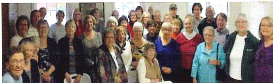
2018 BNAC Volunteers

In 2010, the Friends of the BNAC began their mission to assure community access to art, nature, history and music. Despite the loss of the gallery, that mission continues and has been accomplished in more ways than we ever could have imagined. The BNAC volunteers and the community have “Come Together” to make good things happen in this peaceful little corner of West Seneca.