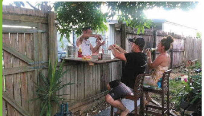
A HIGHLY encouraged fence option to enhance your backyard

As the snow melts away and you can finally see the grass in your backyard, you may be thinking about some upgrades. There are many things to consider; cost, timing, and contractors. But, have you considered what the town's guidelines are? Each town sets different guidelines for things like fencing, pools, and sheds. A visit to the office will help sort all of the issues out before you get too far along in your planning. In almost every instance, your property survey is key to success when determining what you may, or may not, be able to do. Let us help you get it right the first time.