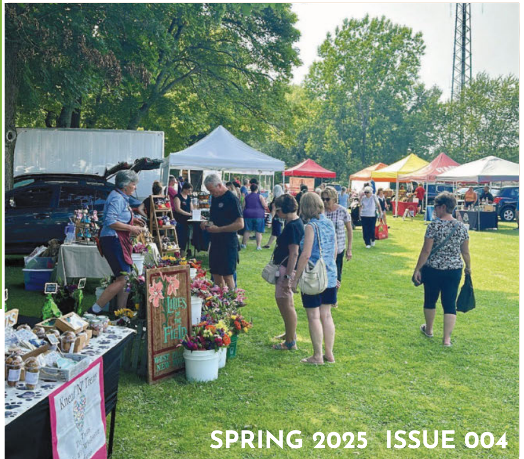
SPRING 2025 ISSUE 004