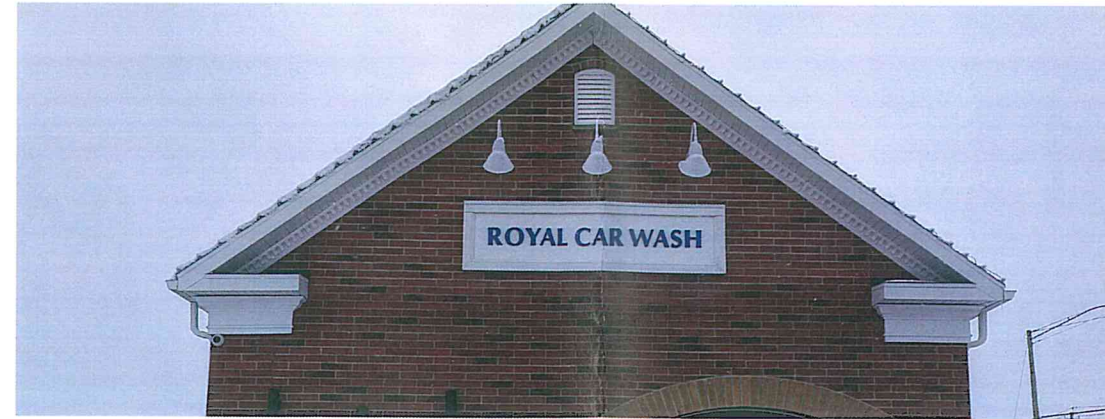
BUILDING MOUNTED SIGNAGE (x2) ABOVE TUNNEL ENTRANCE/EXIT