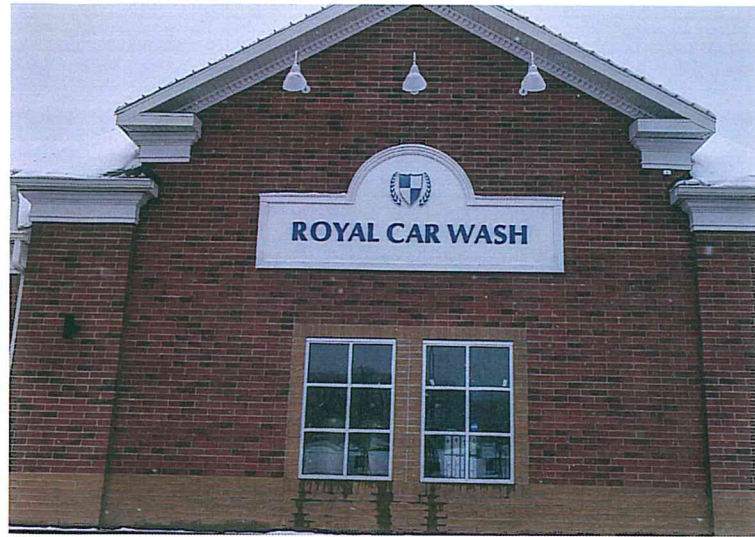
BUILDING MOUNTED SIGNAGE (x1) FACING TRANSIT ROAD